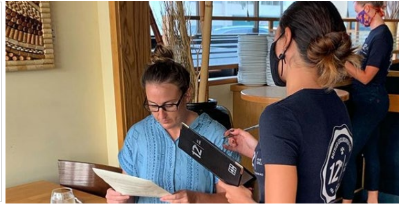
12 th Ave Grill Reopen for Dine-In, check their Instagram here .

Data source : https://www.hawaiiourismauthority.org/research/