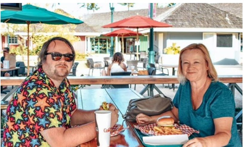
Chicken In a Barrel at Coconut Marketplace reopend for Dine-In. Check their Instagram <u>here.</u>