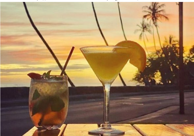
Pi Artisan Pizza at Oultets of Maui is open for dine in service.