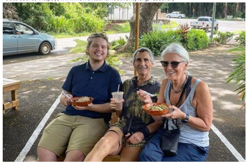
Leahi Health in Old Koloa Town is open

Data source :https://www.hawaiitourismauthority.org/research/