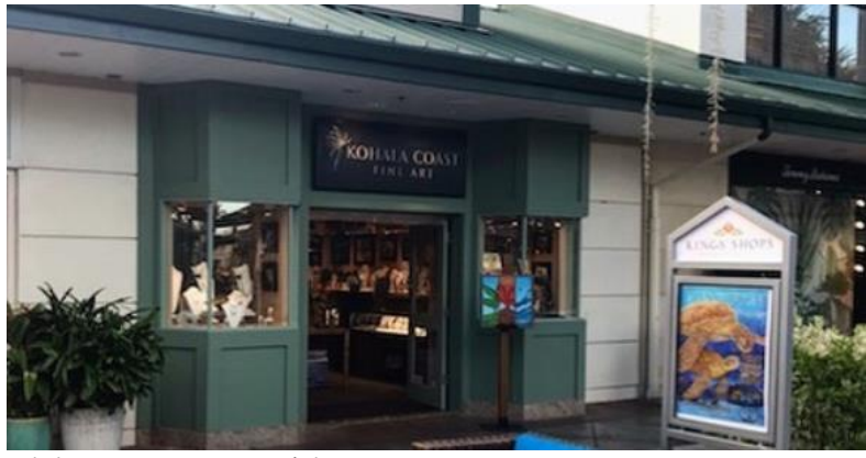
Kohala Coast Fine Art at Kings' Shops is open.