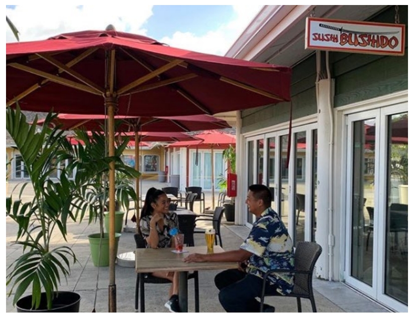
Sushi Bushido at Coconut Marketplace now has outdoor seating