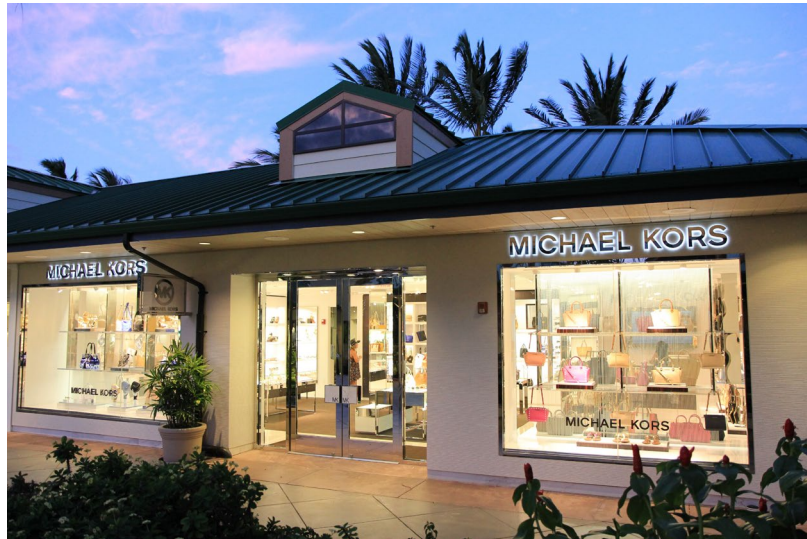
Michael Kors open at Kings' Shops

WANT TO KNOW MORE ABOUT THE CURRENT BIG ISLAND RETAIL & RESTAURANT MARKET?