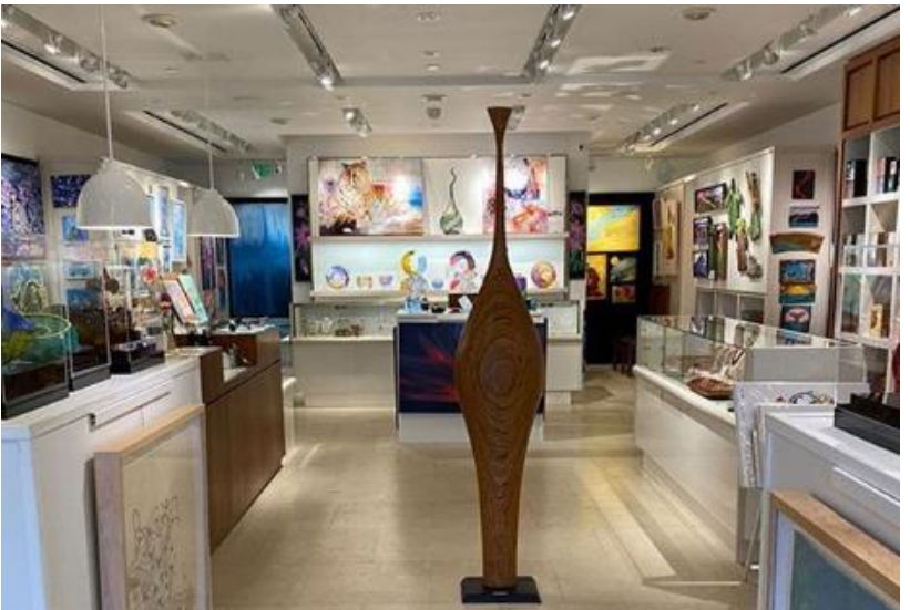
Aesthetic Hawaii at kings' Shops

**Total arrivals include: Visitors, Residents, New Intended Residents, Crew & Transit Data source :https://www.hawaiitourismauthority.org/research/