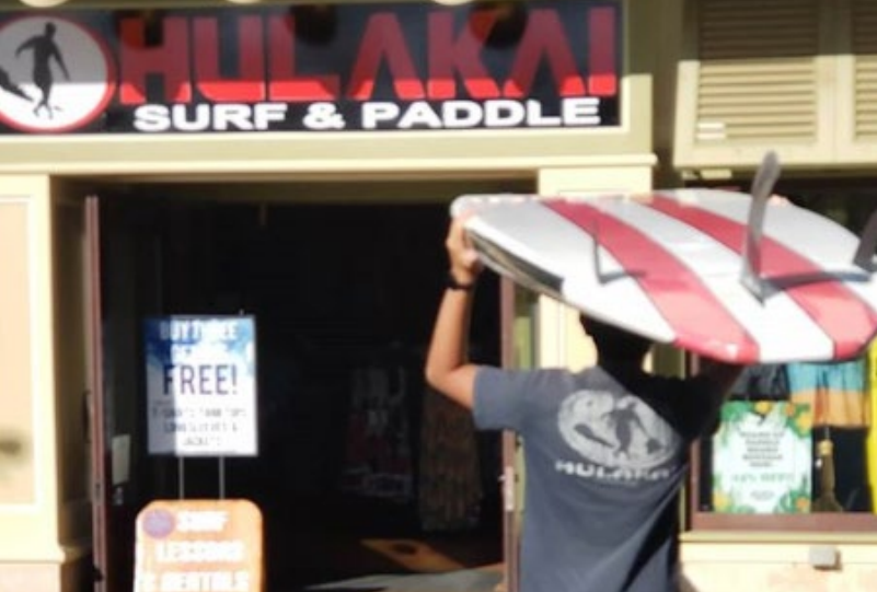
<u>Hulakai Surf & Paddle</u>open at Kings' Shop

WANT TO KNOW MORE ABOUT THE CURRENT BIG ISLAND RETAIL & RESTAURANT MARKET?