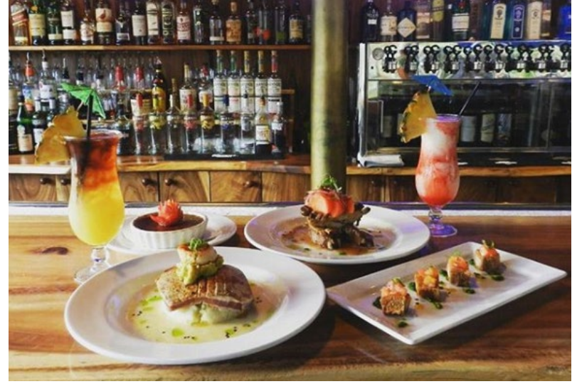
A-Bay's Grill open at Kings' Shop