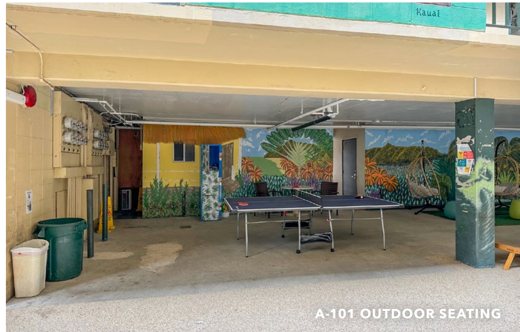
A-101 OUTDOOR SEATING