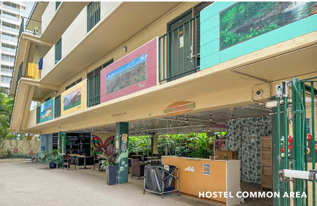
HOSTEL COMMON AREA