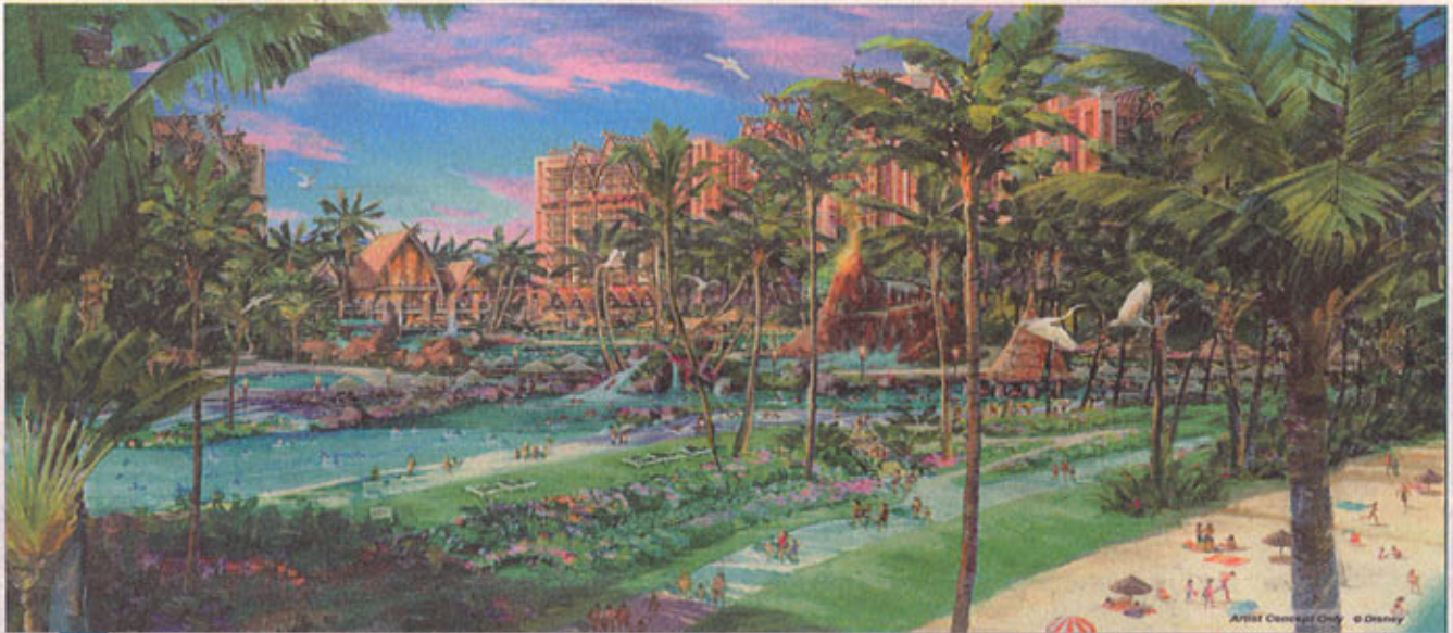
This is what the new Disney resort at Ko Olina is expected to look like. It will have a Hawaiian theme.